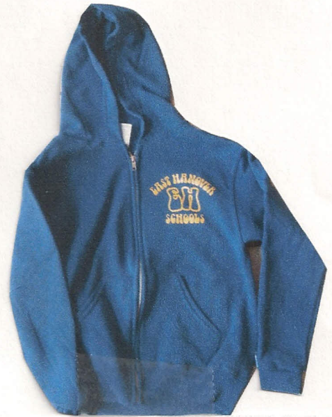
Pull over sweatshirt